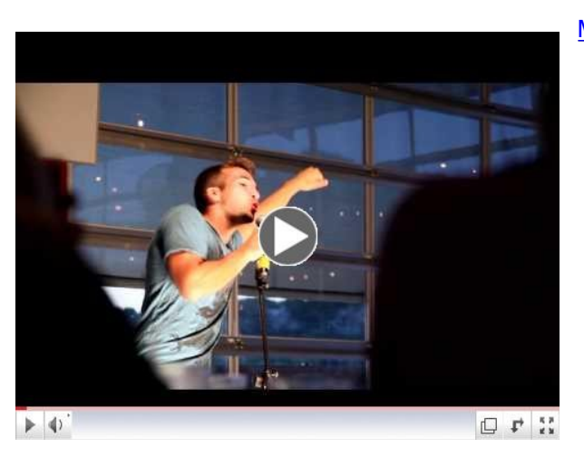
More about CoMeTrY