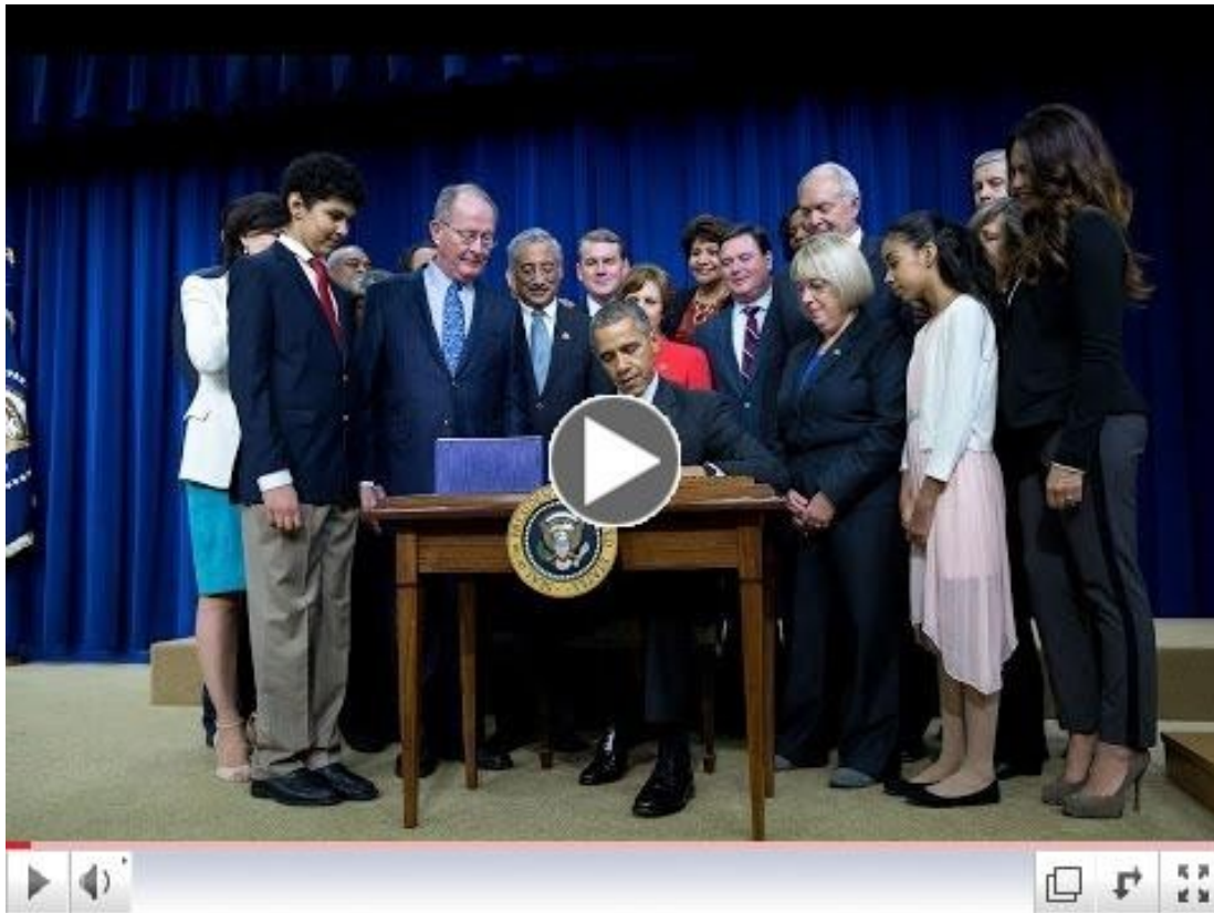
President Obama Signs ESSA into Law - December 2015

The U.S. Congress passed the Every Student Succeeds Act (ESSA) in December 2015, reauthorizing the Elementary and Secondary Education Act.